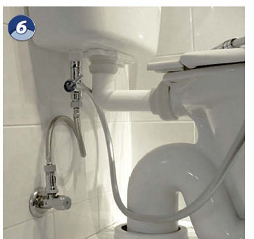
Connect Flex Pipe.