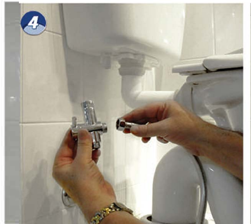
Fit handspray hose to water diverter, ensuring you insert black washer.