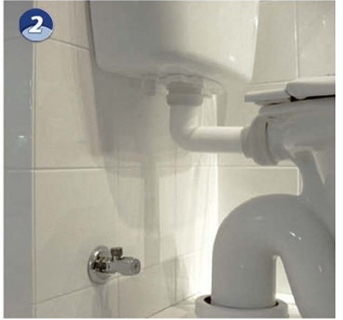
Remove flex pipe.