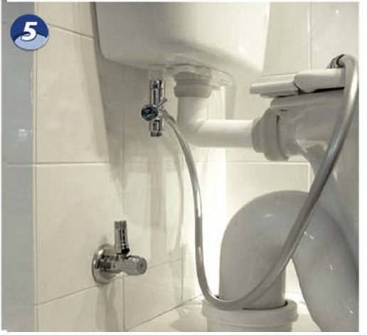
Fit water diverter to Cistern, ensuring you Insert Black Washer.

Place dual check on tap, ensuring you insert into the bottom of the backflow dual check.